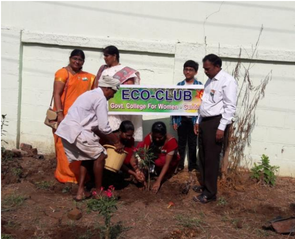
Plantation by students