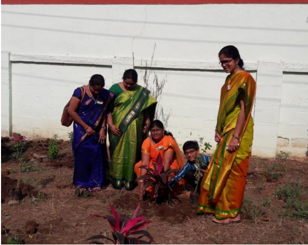
Plantation by faculty